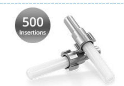
The precision ferrules can reach up to 500 times insertion lifespan.